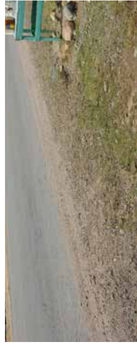
and stands along the highway Bishkek-Osh where the herders sell their dairy products.